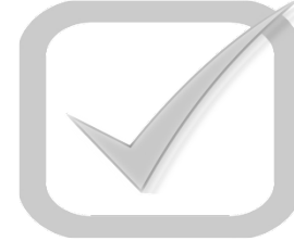
Student and faculty surveys