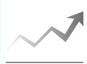
Monitoring progress toward goals